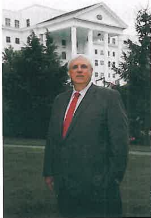
As a surprise to Marriott Hotels & Resorts, which was under contract at the time to purchase the property, Jim Justice bought The Greenbrier in May.